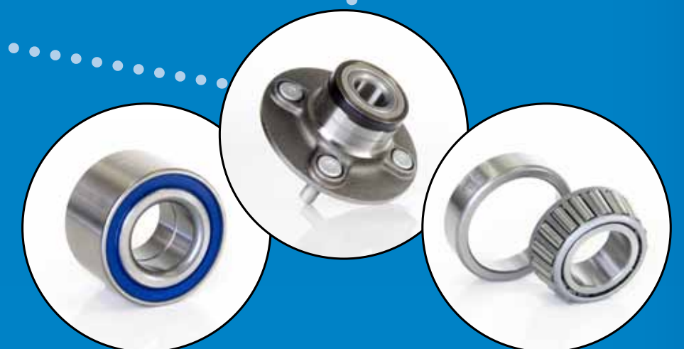
Wheels and Hubs