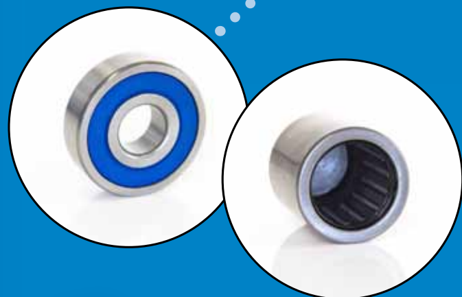
Alternators and Starters